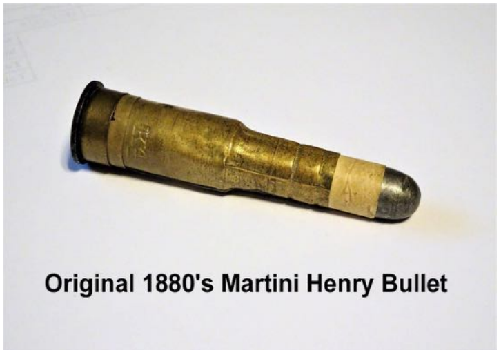
Original 1880's Martini Henry Bullet