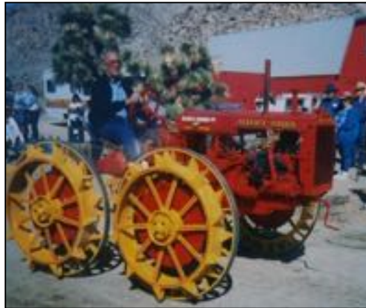
Sunny Rowlands August 7, 2016