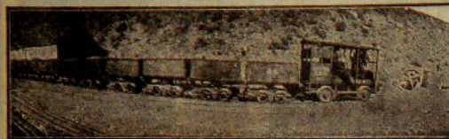
Yellow Aster Mining & Milling Co.'s Train. Another Illustration of the Locomotive is Shown Below.

"Union" Engines are used by the Governments of UNITED STATES, GERMANY, FRANCE, JAPAN, NEW ZEALAND, NEW SOUTH WALES, FIJI.