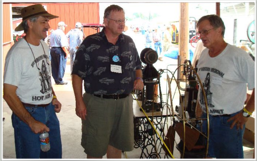
Hot air engines in Kansas.

This advertisement from 1905 shows a Union engine powering a small locomotive used in the Yellow Aster Mine. The Yellow Aster is just uphill from Randsburg, California, near Mojave. Union engines are very rare today and sought after by collectors.