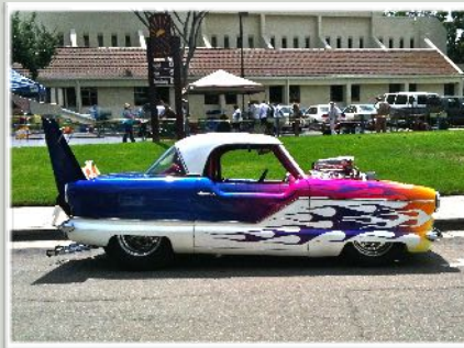
We were surrounded by nice cars.