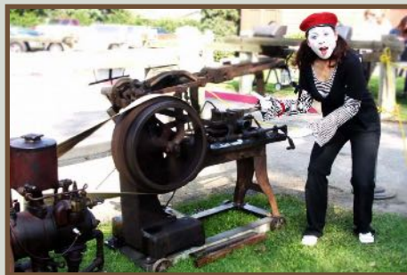
Safety First! No clowning around!