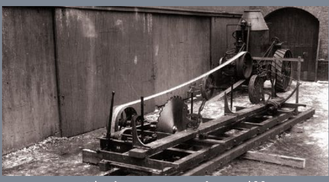
Westinghouse powered sawmill