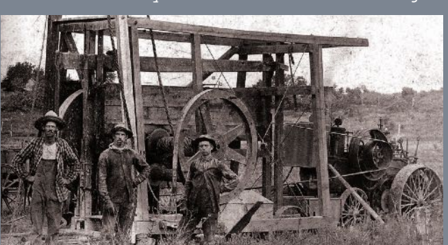
Robinson powered drilling rig