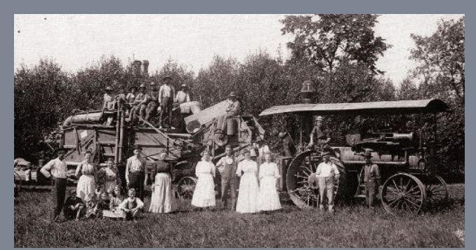
The whole family with their C. Aultman Mogul