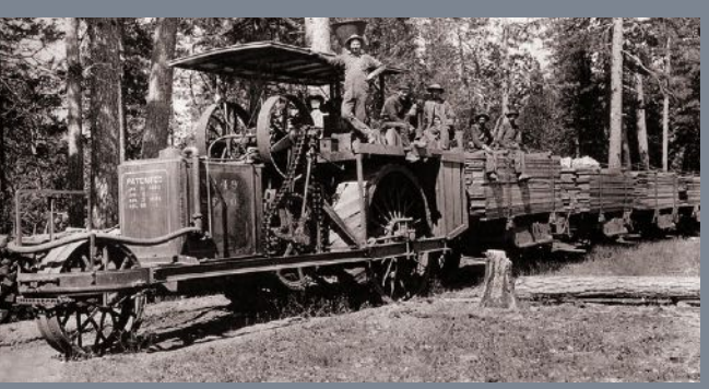
Holt hauling lumber