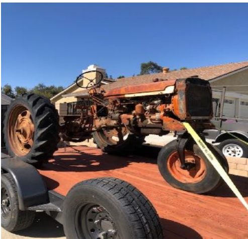
BOB SMITHS LATEST PROJECT FARMALL MODEL C

FOR SALE CONTACT DAVE RUHLAND 714-745-7572