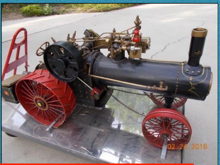
2 scale steam tractors. Can be run on compressed air. Would like what Arnold paid for them.