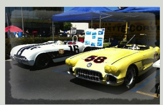
Corvette pace cars