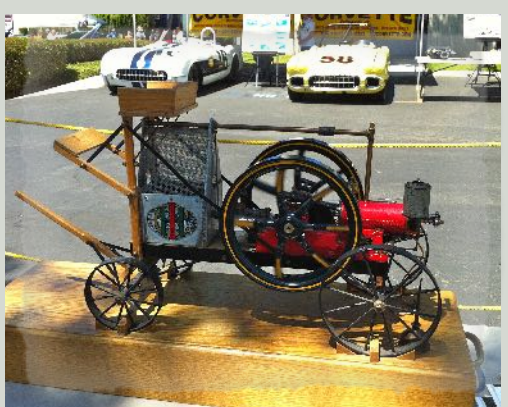
Dan Kato's International model