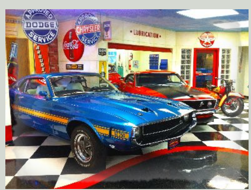
A section of the Surf City Garage set up like an old filling station