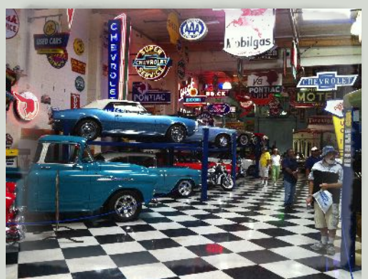
GM section of the Surf City Garage