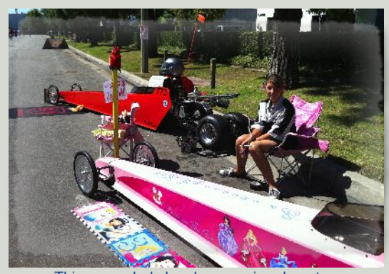
This young lady has been racing dragsters for six of her fourteen years.