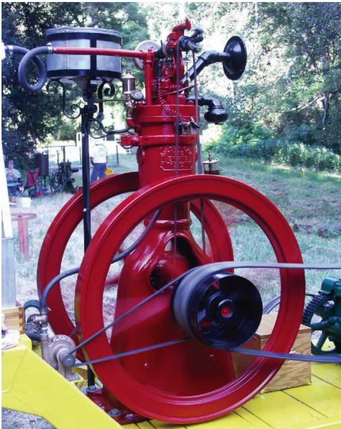
1893 Golden Gate Engine, San Francisco